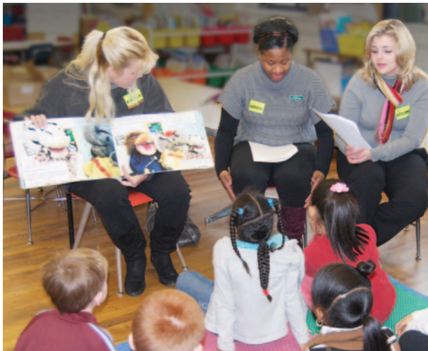
RN candidates from SCCC role play as they read first-graders a story about Elliott (PRASAD CDHP's elephant mascot) and his first visit to the dentist.