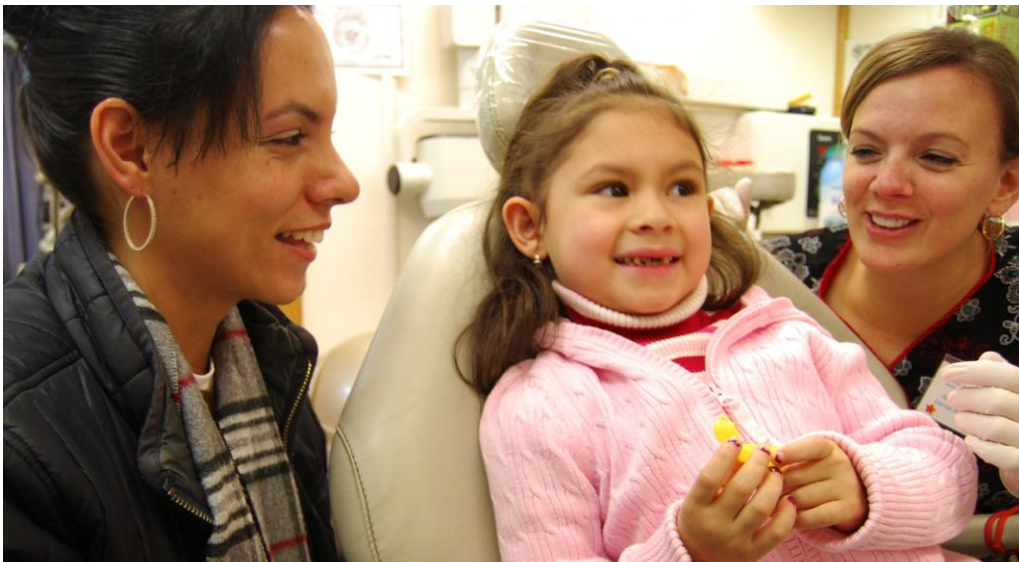
PRASAD Children's Dental Program Inc.